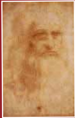
Leonardo da Vinci

... with large and small paintings. Even people of the Stone Age made pictures on the walls of caves. Ever since then artists have used paint to express how they see the world. All of these pictures together couldn't fit into even the largest book, of course, but in this art coloring book you can find fourteen especially important artists from different times.